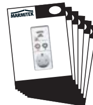
1x User Manual English, Deutsch Français, Español, Italiano, Nederlands