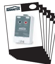
1x User Manual English, Deutsch Français, Español, Italiano, Nederlands